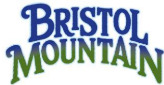
Photo Upload Guide

After you select Upload Photo on the GUEST DETAILS page you will be directed to the GUEST PHOTO UPLOAD page. Select Choose File and select a photo from your computer that you would like to use for your Snowsports Club Pass.